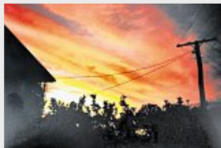
ABOVE: Cloud formation at sunrise.