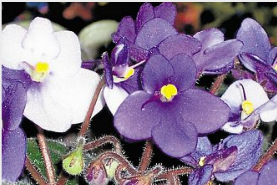
A unique violet in Bundaberg. The flower has two colours on the same plant.